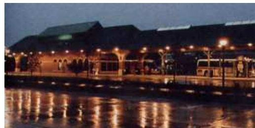
Janesville Transit System Downtown Transfer Center